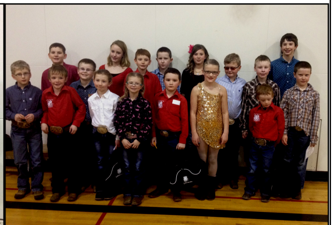
All the club members gave great speeches!