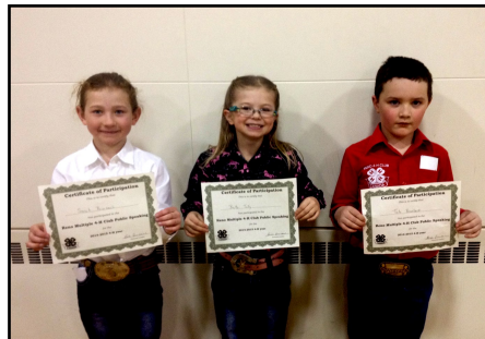
Cloverbud Speech Winners