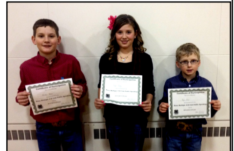
Junior Speech Winners